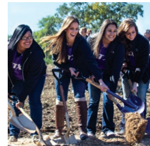
Left to Right: 1. CTX softball players break ground on the field in 2014. 2. An aerial view shows construction of the field, and its proximity to the baseball field. 3. Students throw around the ball on the newly completed field on a cloudy day. 4. The state-of-the-art softball field was finished in January 2016.

The initial building project includes the field, dugouts for home and visiting teams, seating for 300, a press box, and additional parking. Long