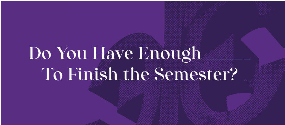
Enough is our Concordia University Texas theme for the 2023-2024 academic year.