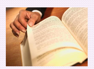
Faculty & Staff FERPA Training

Each institution of higher education, to some extent, can determine what information is classified as directory information.